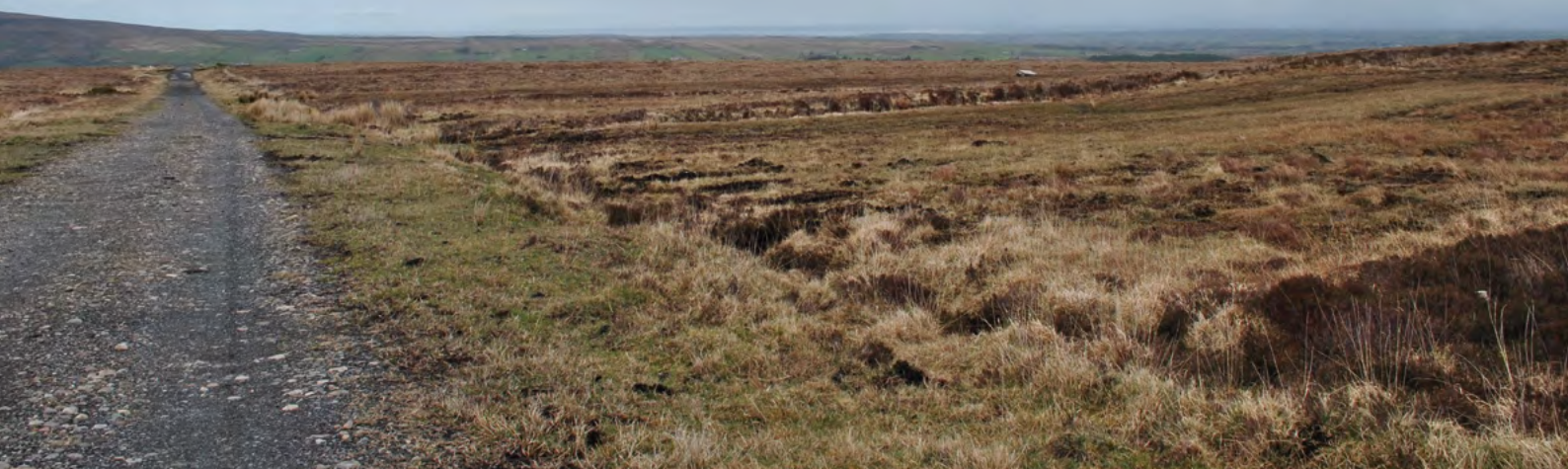
View of the site from an internal road