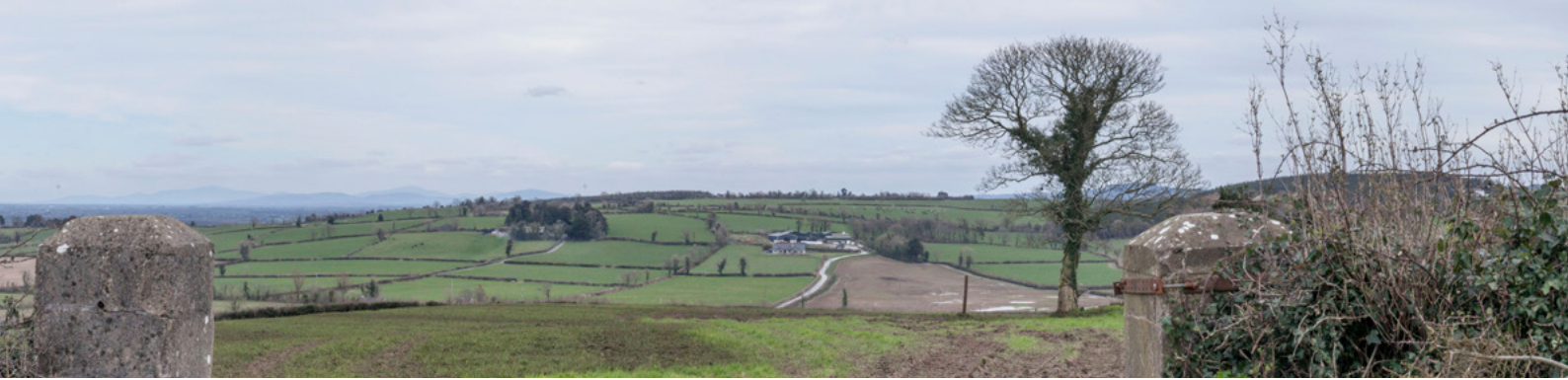
View from a local road at Curraheen towards the Site to the East