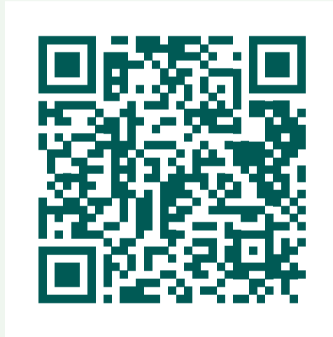
Planning Policy Statement 18 Renewable Energy