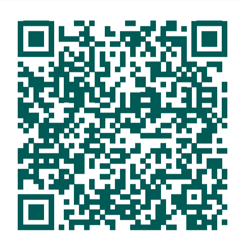
Strategic Planning Policy Statement for Northern Ireland

“...renewable energy projects in accordance with PPS18” (emphasis added hereinafter)